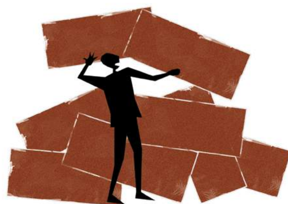
On Your Own

A Partnership That Will Elevate You To Where You Want To Be.