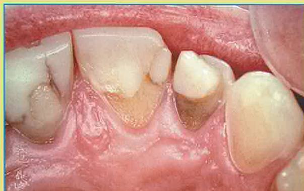
Over time, frequent reflux will dissolve enamel and expose underlying dentine