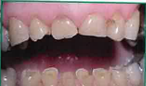
The home care program comprised an application of GC Tooth Mousse each night, in combination with sodium bicarbonate mouthrinses after each meal and again after any episodes of reflux.