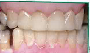
After the buildups the teeth look and feel much better.