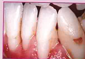
The teeth now have much less plaque and are now hypermineralized offering greater protection against further problems.