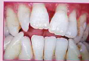
After starting a home care program to promote remineralization and a series of appointments for cleaning and restorative work, the situation has improved. Daily use of GC Tooth Mousse, used in conjunction with a triclosan-releasing toothpaste (Colgate Total™) and flossing, is a key part of Antonio's home care over the long term.