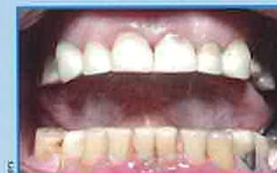
Full composite resin crowns placed over the prepared teeth