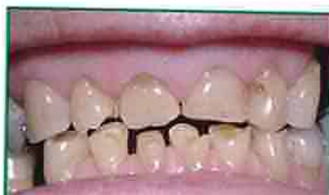
Many teeth had become worn, chipped and very sensitive.