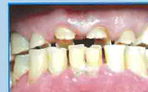
Severe tooth structure loss accelerated by the acidic oral environment and poor quality saliva

He was also advised to continue with his home care treatment due to the slightly acidic nature of his saliva and the need for constant monitoring.